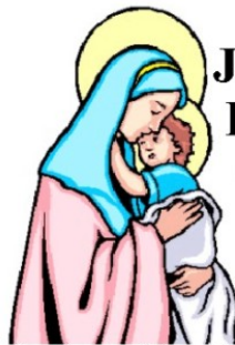
Our Lady of Good Counsel, Patroness

Joliet Diocesan Council of Catholic Women St. Charles Borromeo Pastoral Center 101 W Airport Road Romeoville, IL 60446