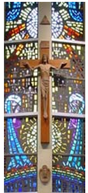
figure of Christ, represent the Holy Trinity.

Reflection: Am I one of those figures with upraised arms? Am I a light to the world?