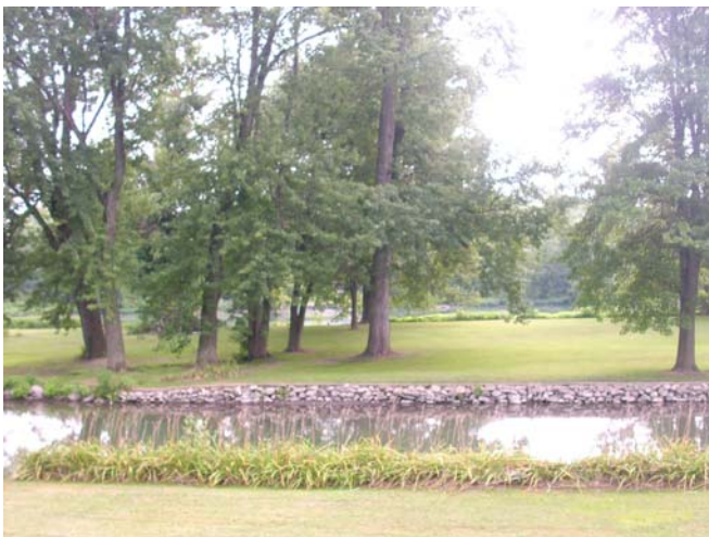
My awesome vista

I did the same as I began remodeling my own house. I just put the dream out there, wondering if it were God’s will too. Whenever I wondered if I were trying to bite off more than I could chew, - in a “coincidence? I think not” way - inevitably I’d get the message, “hold onto your dreams.”