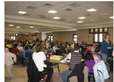
Families celebrate with lunch.