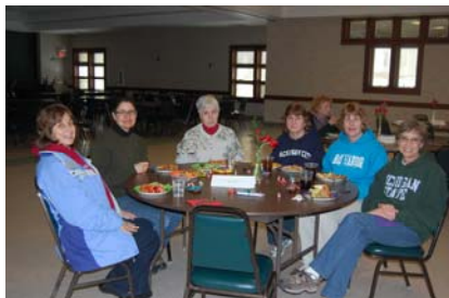
Teachers relax at lunch.

Wednesday was Student Appreciation Day which means lunch is served by their teachers. RSC members, along with parent volunteers, prepared pancakes and sausage for the students. Seventh grade students participated in a 7 th Grade Retreat at Bethany House on Thursday. The week ended on Friday with the Teacher/Staff Appreciation Lunch and a Family Movie Night in the gym with the movie "Up".