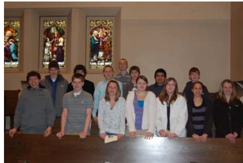
8 th Grade Students at St. Mary's Cathedral