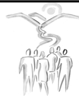
Growing as an Engaged Community

May the Lord bless us in the months ahead as more of our parishioners discover who they really are as children of our beloved God. And in the discovering new life emerges.