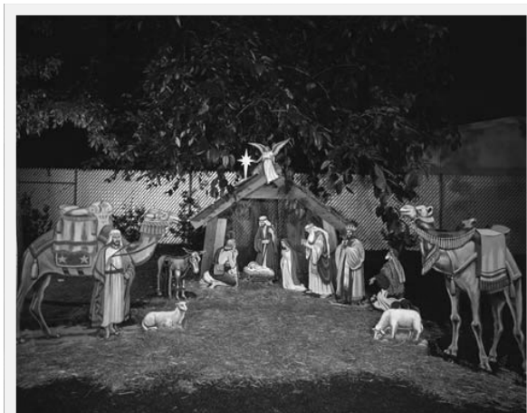
Belen (The Nativity Scene)

Growing up in the Philippines, for me and for most, it