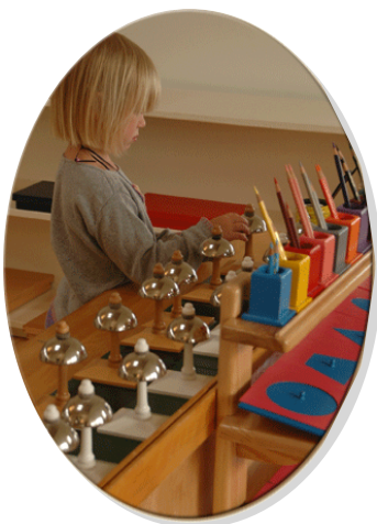
10:1 Student to Teacher ratio