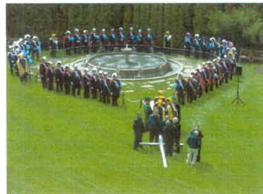
The Living Rosary (during ceremony)

The Rosary is truly a beautiful prayer. But to see and hear it in LIVING COLOR is just an experience that I will never forget! I hope that each and everyone of council #9131 who has a chance to visit the Island during the state convention does so. It is a memorable event and the company was most enjoyable.