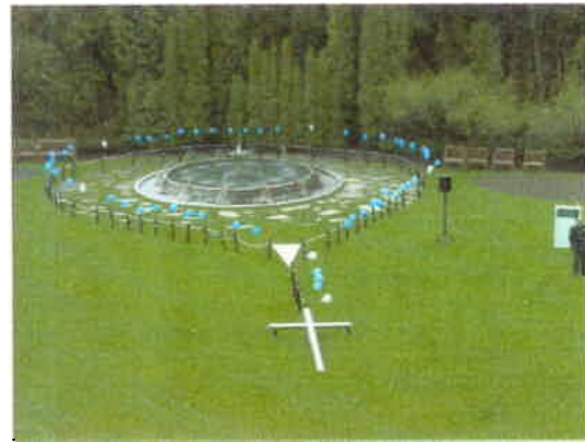
The Living Rosary (before)