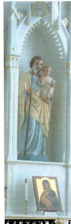
(St. Ann Church Mackinac Island)