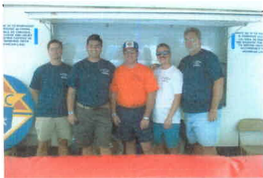
Centennial Festival 2002

We will be having our 100 Year School Celebration in June. I would like to ask every Knight to attend this year and help if possible. We will be sponsoring the beer tent again this year and will need volunteers for both Saturday and Sunday for beer tenders!! Please see me at the council meeting for a sign up sheet. Last year's celebration was a great fund raiser for our Parish. Let's make it happen again this year!