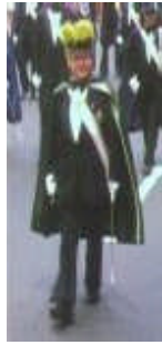
District District Commander