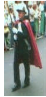
Corp Color Member

When a Fourth Degree Member or Color Corp Member is dressed in his tuxedo there are seven miniature jewels he may wear if he validly holds the title of a Past or Former Officer. Six of the seven jewels are shown below. The one for Former Supreme Director is missing. They are from left to right: