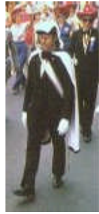
Marshall Faithful Navigator