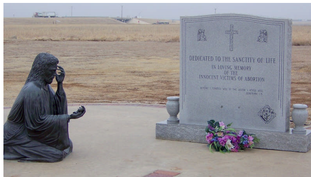
Dedicated to the Sanctity of Life in Loving Memory of the Innocent Victims of Abortion