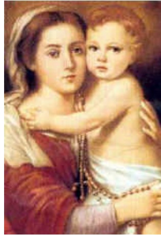
Our Lady of the Rosary, Pray for Us that we may be made worthy of the promises of Christ

Join Council 389 at 4pm on October 13th in the Chapel at the Grand Rapids Home for Veterans for the monthly rosary.