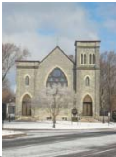
St. Mary's after a snowfall.