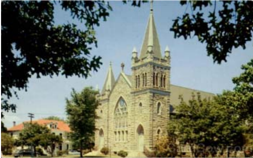
St. Mary's and the rectory