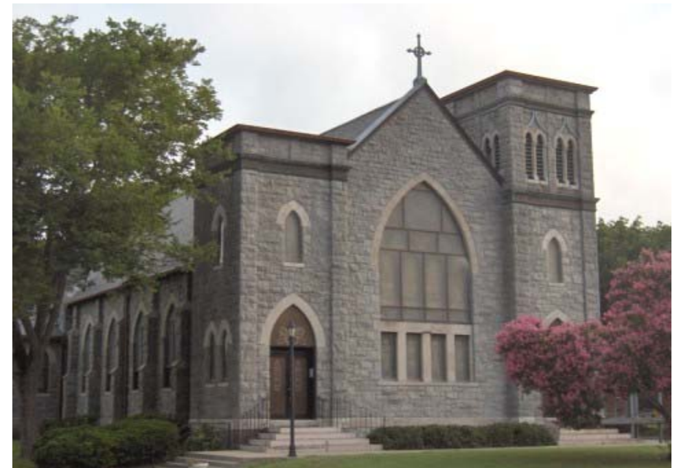
Image is on the banner in the back of the church.