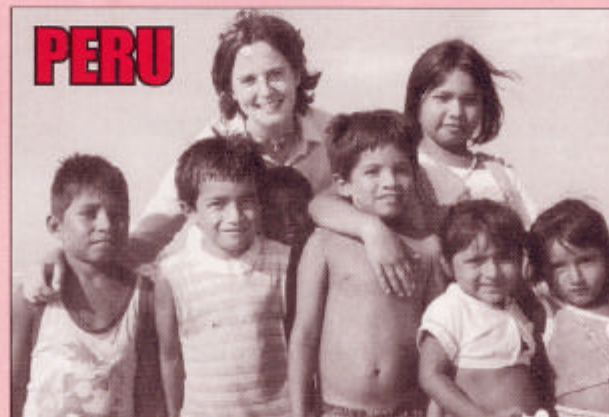
Children Love a Camera

Home Works' activities will focus on providing home repairs to homeowners in need, assisting youth in their development and empowering communities to meet the needs of its members.