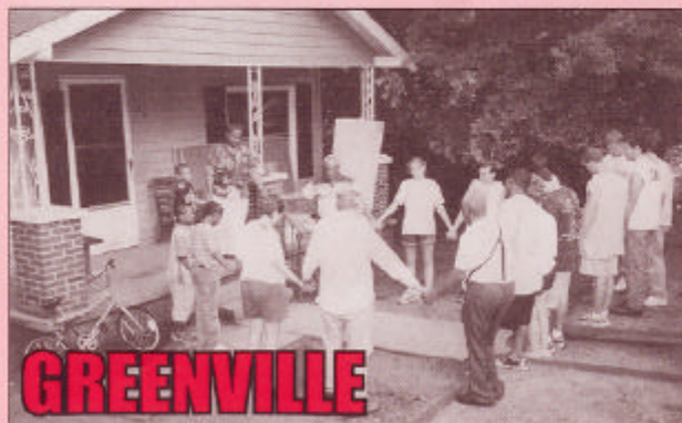
Our days of service begin with prayer

Each day will be spent renewing homes by doing such things as painting, basic construction work and plumbing, caulking, housecleaning, roofing, and spending time in prayer with the families we are serving.