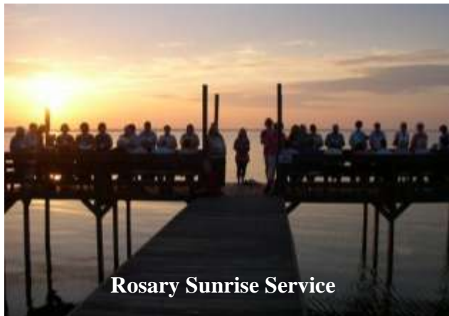
Rosary Sunrise Service