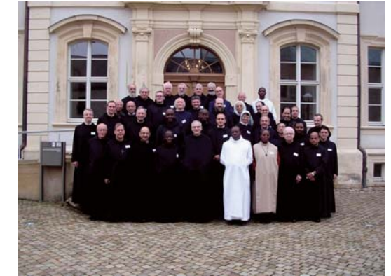
General Chapter Participants 2009

There were presentations on the Rule of St Benedict and periods of discussion and reflection. During the Chapter a petition from the Benedictine Nuns of St Lucia, West Indies, to obtain affiliation with our Congregation was considered and accepted. This will strengthen the relations between our monastery in Trinidad and our new-found sisters in St Lucia.