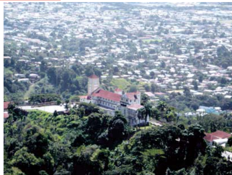
An aerial view of Mount St Benedict

The Abbot and monks are very grateful for the wonderful support that you have given the Abbey over the past year. You are being constantly remembered in our prayers.