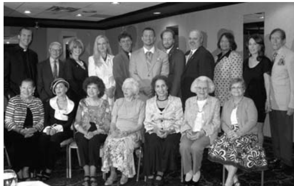
New members at the May meeting.