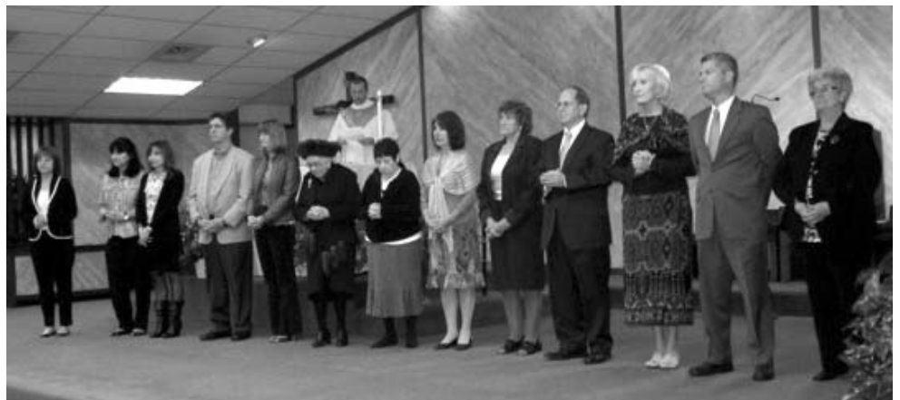
New members inducted at the memorial mass.