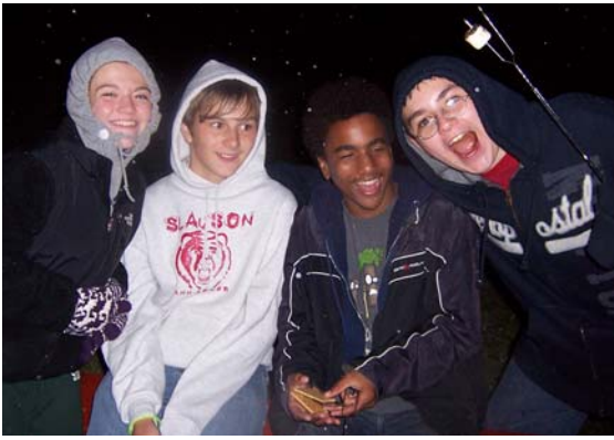
S'mores at October's Corn Maze Social!