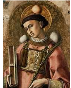
Saint Stephen— One of the first seven deacons of the Church.

learn much about my own priesthood because of the witness of these fine men.